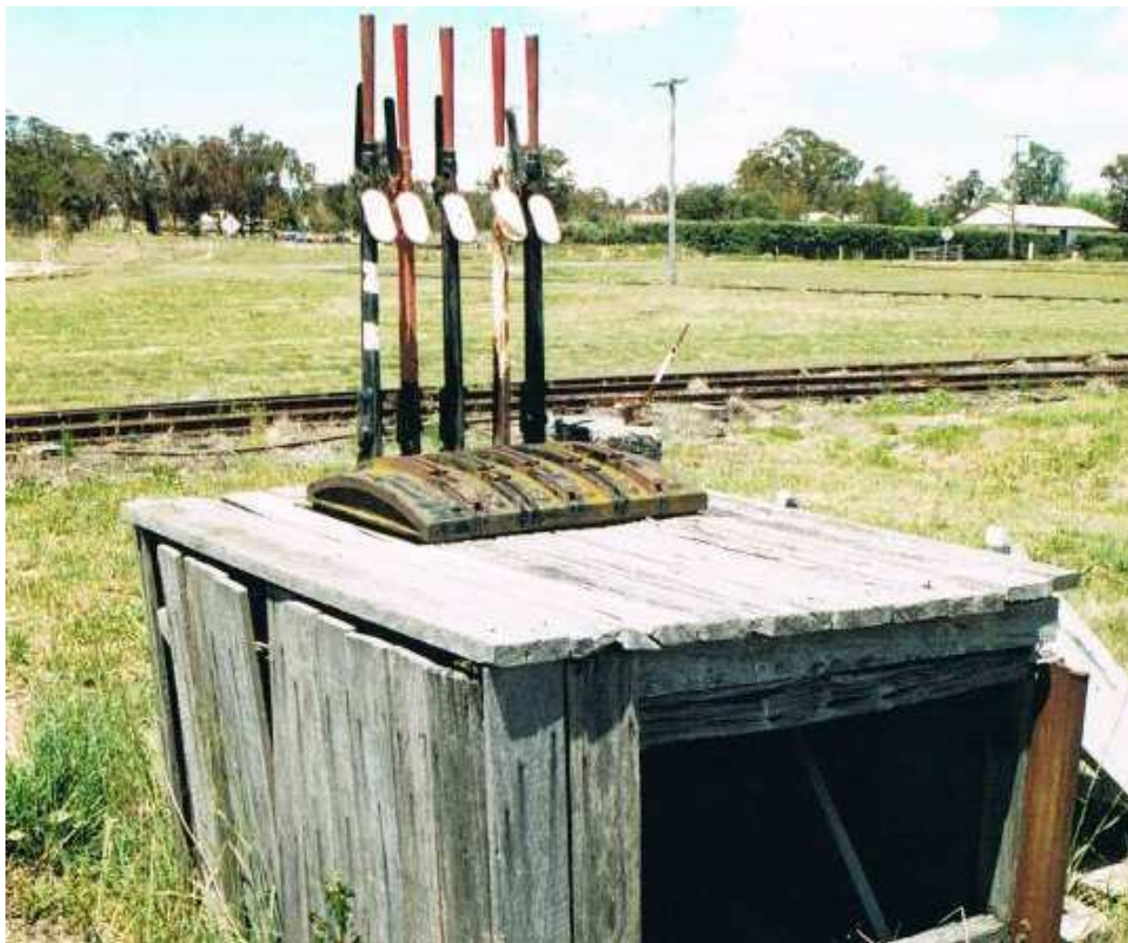
Wallangarra yard – That Open Frame was on a boxed-in Platform, chosen as the basis for the model.

Photos used to 'capture' the character of Queensland Railways Outdoor 'Open' Frames.