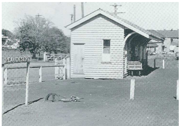
Beauesert with a remote ground throw.