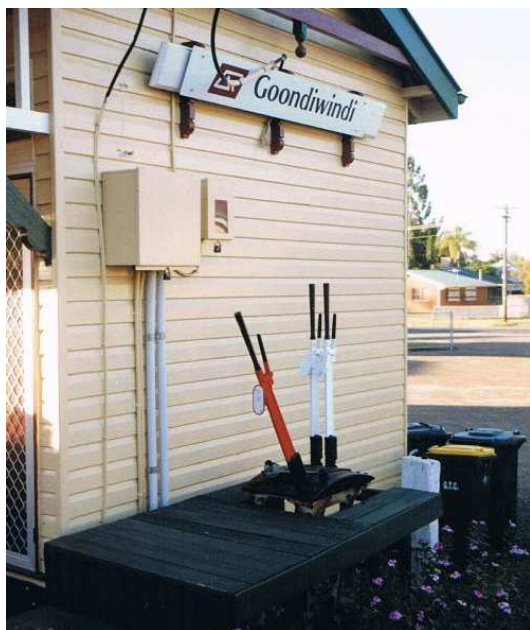
Goondiwindi Frame was attached to building.

Photos used to 'capture' the character of Queensland Railways Outdoor 'Open' Frames.