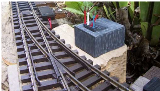
The finished model in 'close up' - - - - - then - - - - - located to final place at Portage Junction .