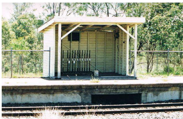
Helidon had three walls clad from weather.