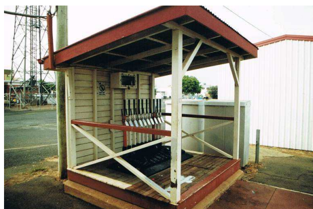
Mareeba had a rear wall only.