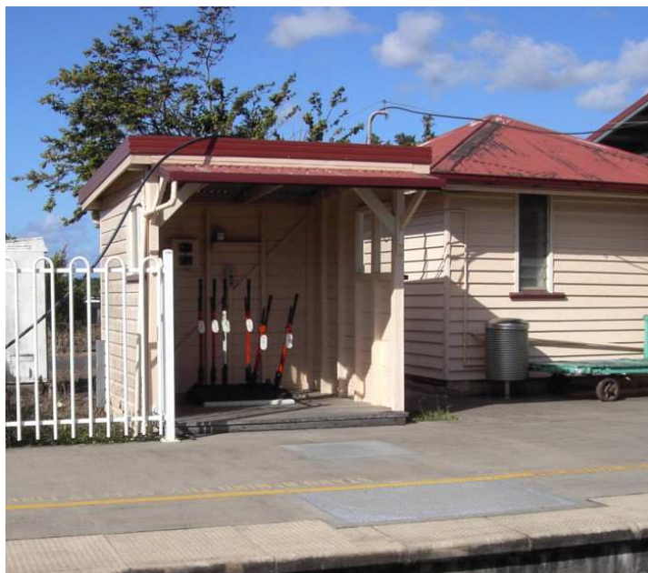
Innisfail was stand alone three walls clad.